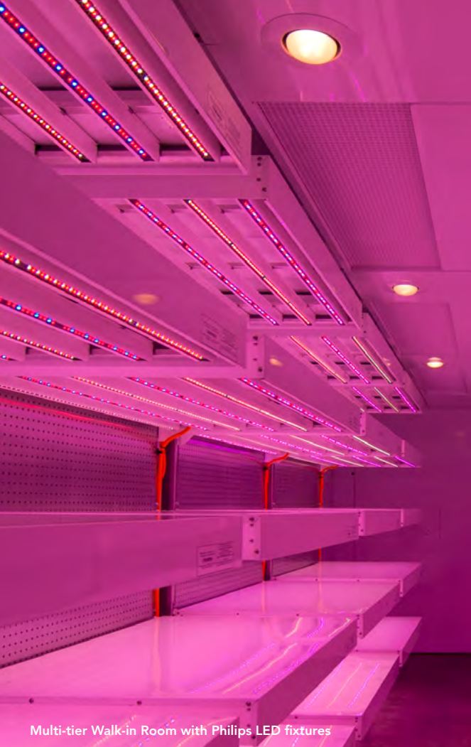
Multi-tier Walk-in Room with Philips LED fixtures