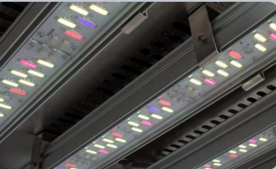
A1000 Chamber with Valoya NS1 LED fixtures

When it comes to LED lighting, Conviron continues to lead the industry with innovative solutions. Contact one of our company representatives for assistance in determining the LED option that is most appropriate for your controlled environment needs.