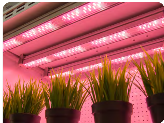
A1000 Chamber with Valoya LED fixtures