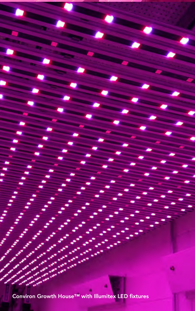
Conviron Growth House™ with Illumitex LED fixtures