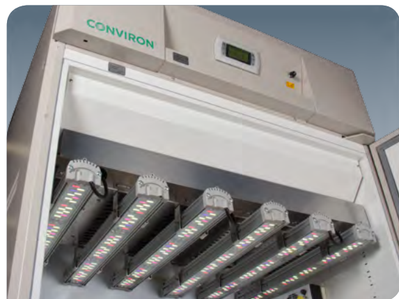
A1000 Chamber with Valoya NS1 LED fixtures

LEDs are an energy efficient light source for plant research in controlled environments. LEDs direct all their light toward the plant without the reflectors required by other light sources that emit radially. While LEDs emit significantly more light per unit of input energy than fluorescent bulbs, they also produce less radiant heat, and can therefore be placed closer to plant material. With less waste heat, the cooling requirement for the controlled environment is diminished and the total energy used by an LED-equipped chamber is substantially reduced.