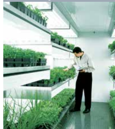
MTPC Series Veg Room