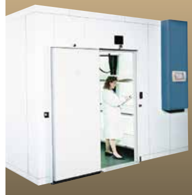
Multi-tier Tissue Culture Room