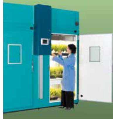
Clone Propagation Chamber