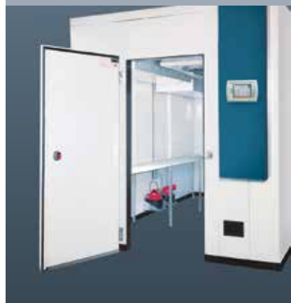
Walk-In Mother Room