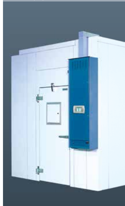
Walk-In Drying Room

Our higher capacity drying rooms are designed with downward airflow to provide uniformity of environmental conditions throughout the larger space.