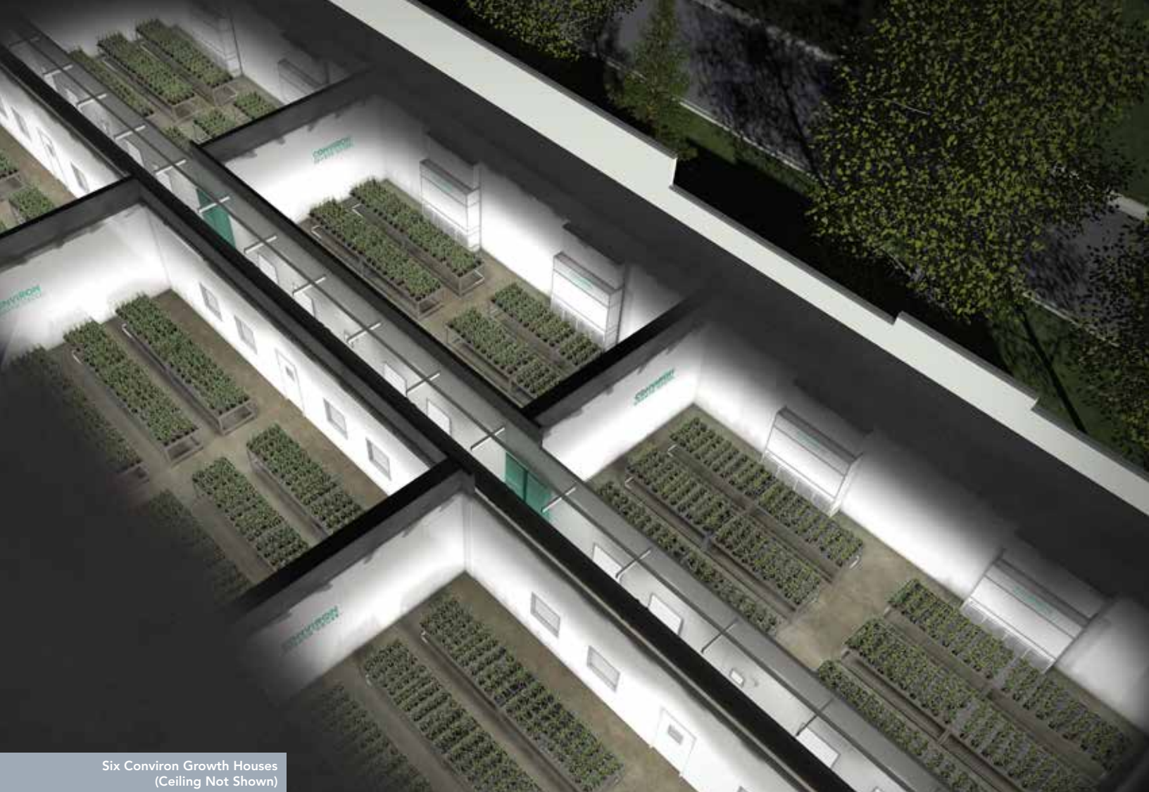
Six Conviron Growth Houses (Ceiling Not Shown)