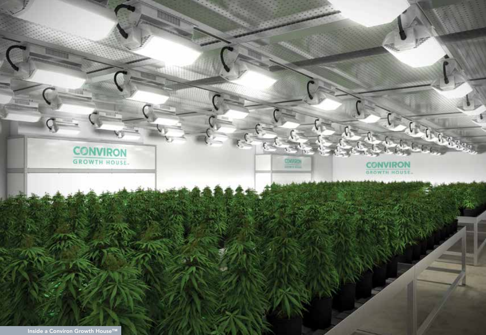
Inside a Conviron Growth House™